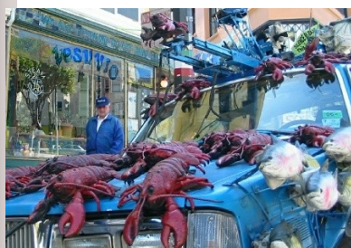
Sashimi Tabernacle Choir