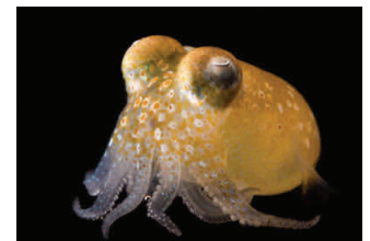
Sepiadium Kochii Tropical Bottletail Squid Encyclopedia of Life

The EOL contains many articles. For starters, check out their Topics in Biodiversity .