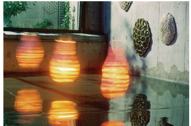
Oasis by Backa Carin Ivarsdotter. Coil-built Porcelain. 2002.