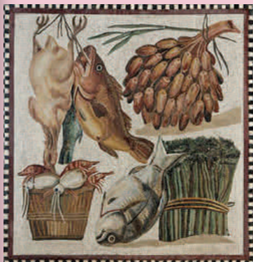
Ancient Roman Mosaic floor depicting fish, fowl and vegetables. About 2nd Century A.D., stone. From a villa at Tor Marancia outside Rome.