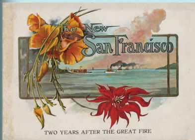
Above: San Francisco, two years after the great fire of April 18, 19, 20, 1906.