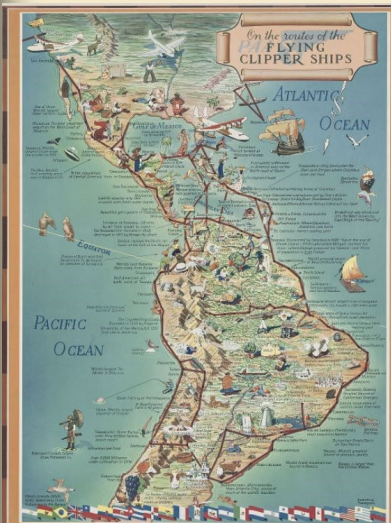
Route of the Flying Clipper Ships 1939.

Maps tell compelling stories about our shared cultural history and comprise one of the most effective forms of communication ever developed. For this reason, this Tip of the Week is devoted to two great sites: The Osher Map Library and Smith Center for Cartographic Education at the University of Southern Maine and the Perry-Casteneda Map Collection at the University of Texas.